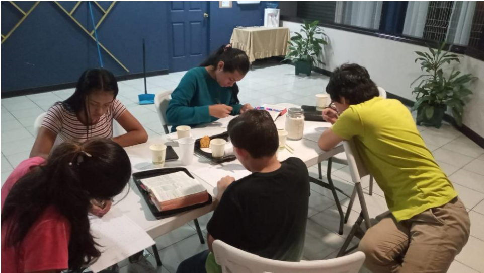
Some pictures of the month of October.