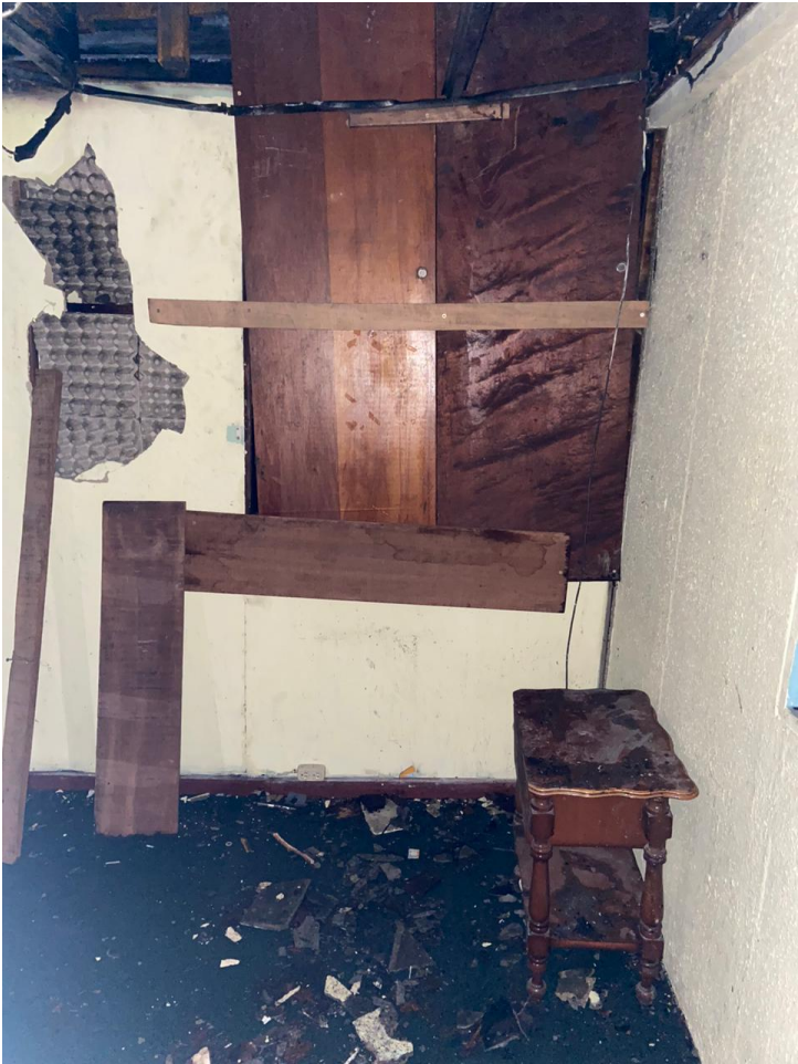
Some pictures of the month of December.